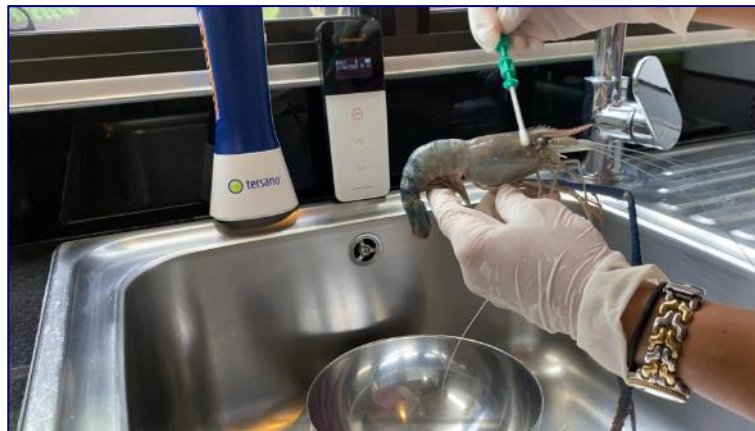
Swabbing a fresh prawn